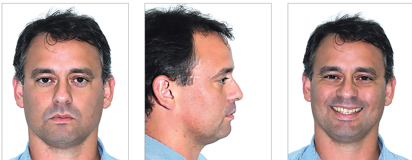
Figure 1 - Example of photograph set-up for diagnosis.

All assessments reached an agreement value that ranged between strong and nearly perfect. Landis & Koch's classification 18 was used as reference.